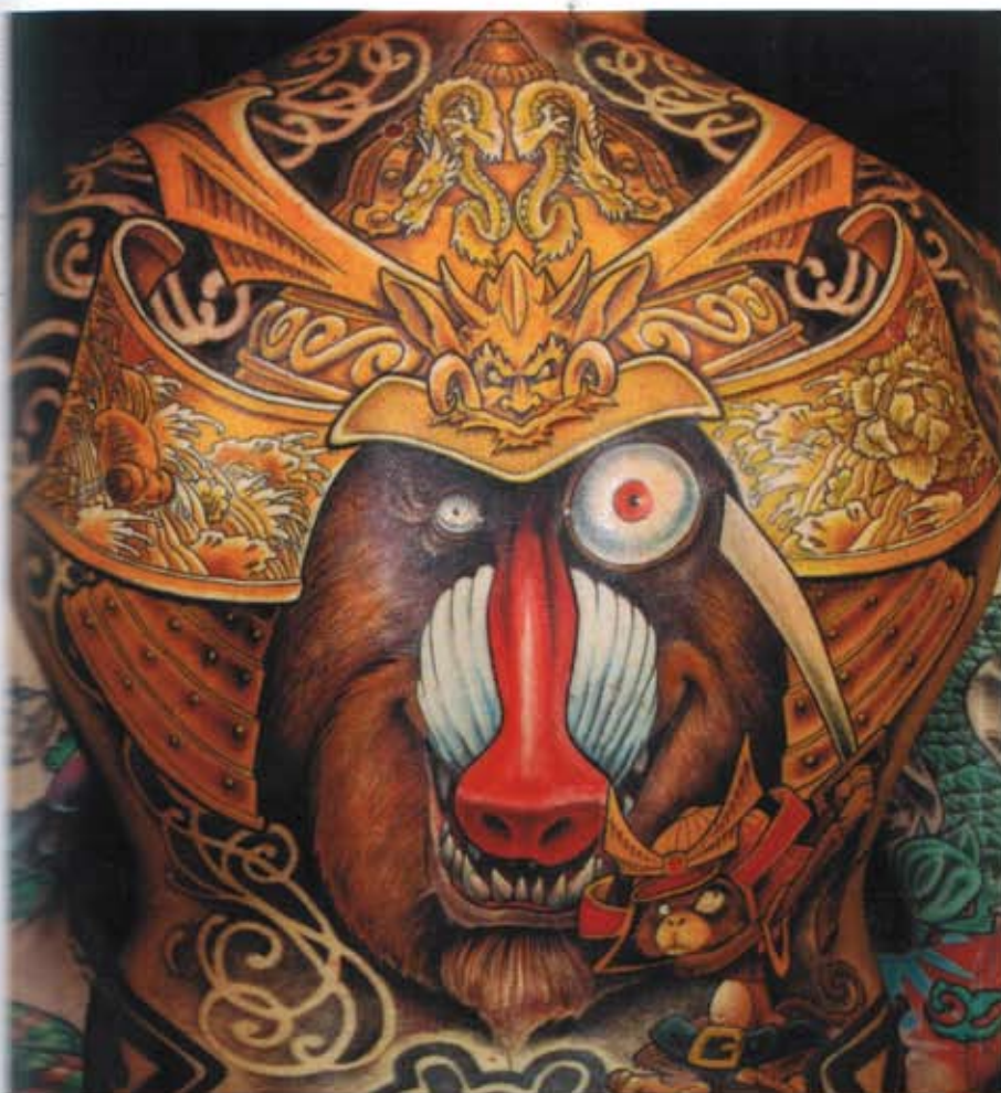
Dimitri combining pop by design and pop art